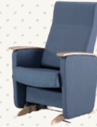
THERA-GLIDE® OASIS ROCKING