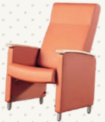
THERA-GLIDE® OASIS STATIONNARY