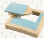
PRE-CURE® PRO CUSHION